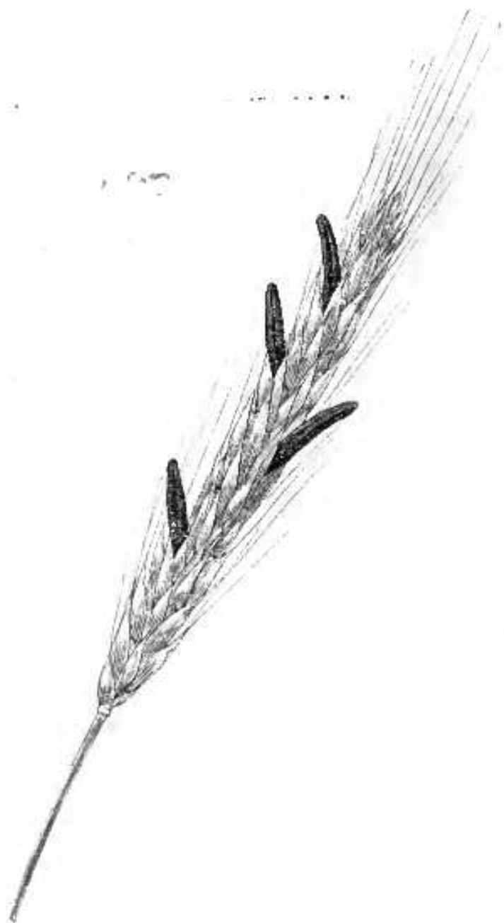
ERGOT OF RYE From a recent sowing