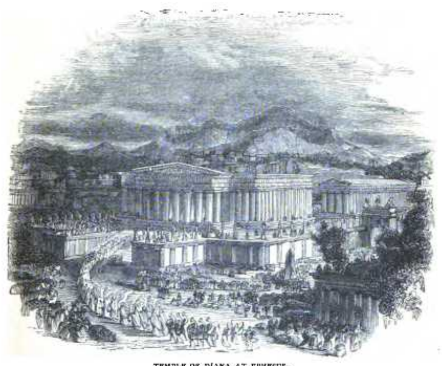
TEMPLE OF DIANA AT BURESUS.