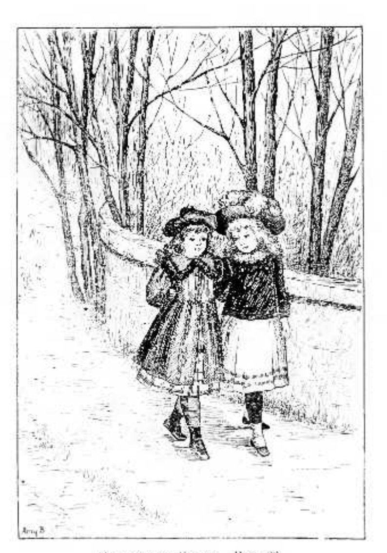
GRACE AND CASSY. Page 23,