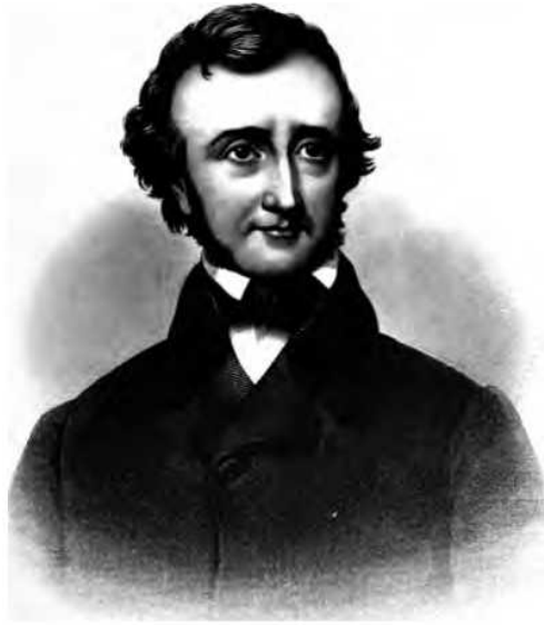
Edgar A. Poe.