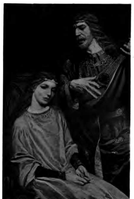
Passing by Howard Pyl