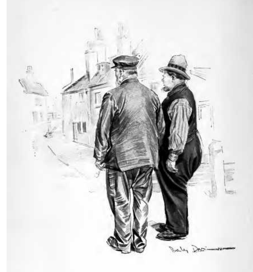
"I hope they won't meet 'er, pore thing," he ses [Page 173]