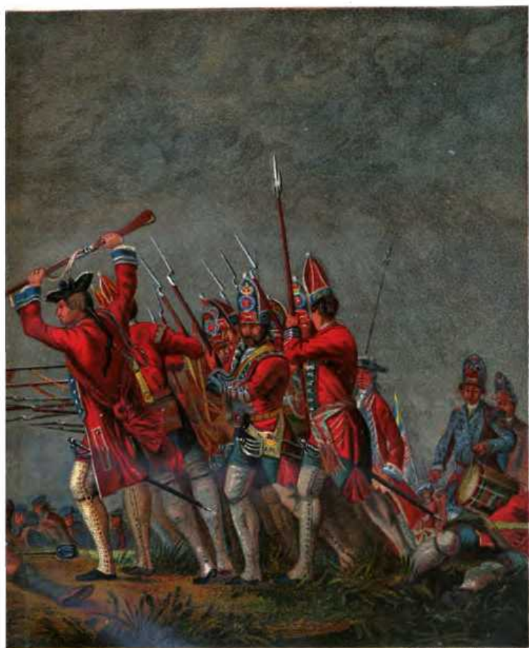
TCH REBELLION, 1745.