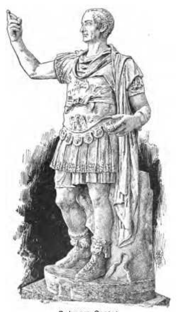
C. JULIUS CAESAR. (Statue in Museum at Naples.)