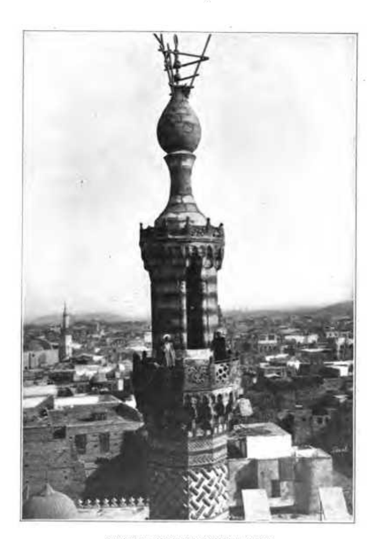
MINARET WITH MUEZZINS, CAIRO