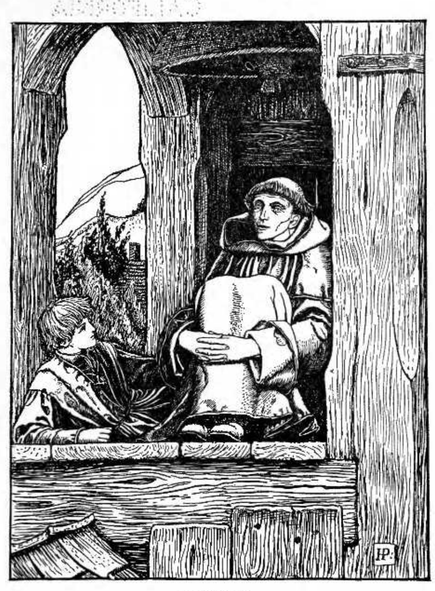
IN THE BELFRY.