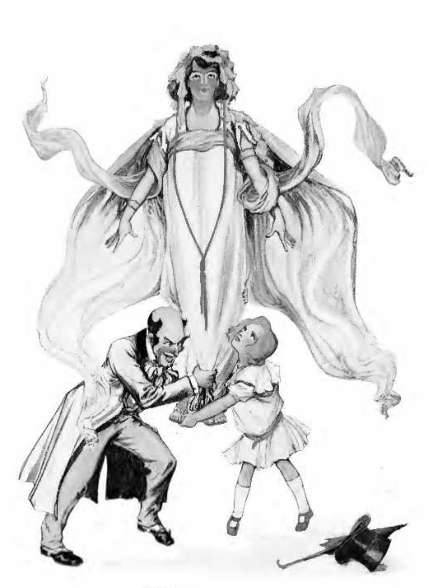
PICKING THE PRINCESS.