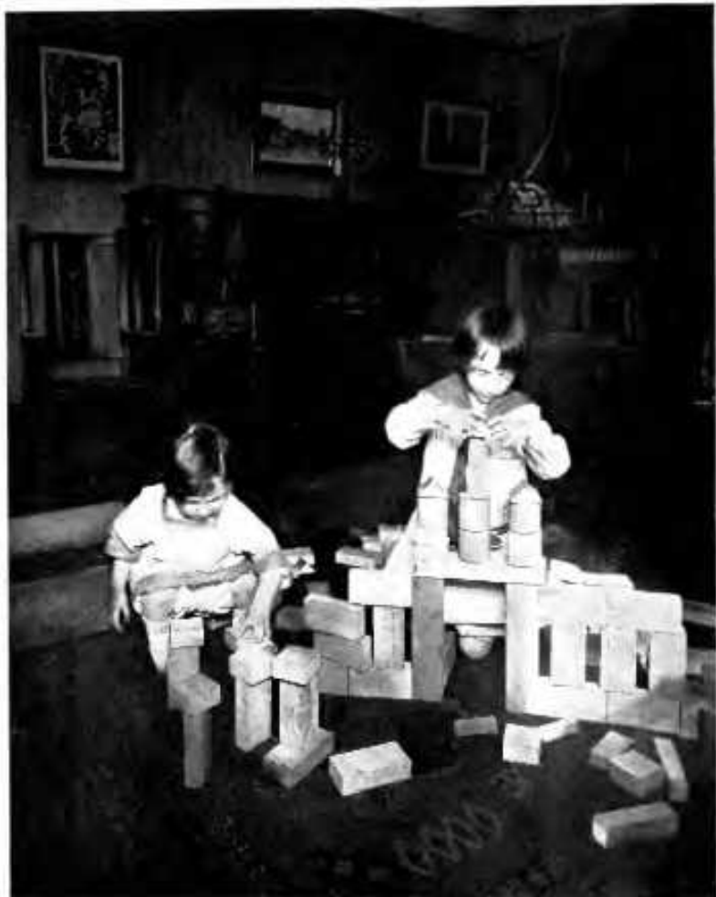
The instinct to create is born in every normal child.