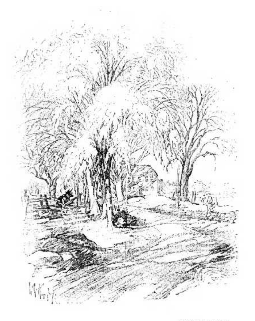
At Meriam's Corner