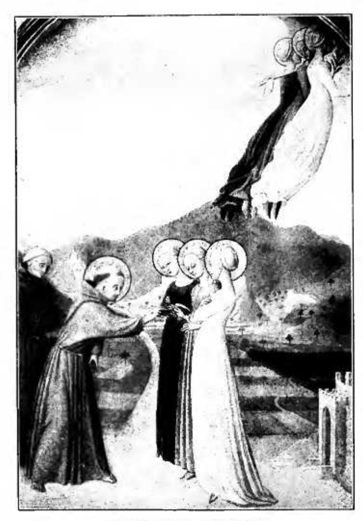
THE SALUTATION OF POVERTY From the Frence by Sacastia in the Murie Conde, Chantilly