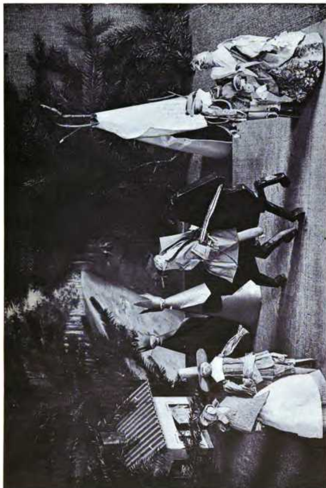
A GROUP OF COLONIAL CLOTHESPINNS To the left, John Alden and Friscilla, to the right, George and Martha Washington. Up through the center rides Paul Revere, while the friendly Indians are seen in the rear. All are made from clothespins dressed in paper. Page 45