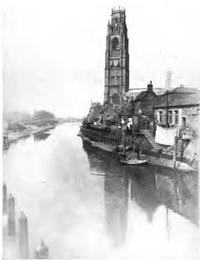
ST. BOTOLPH'S TOWER, AND THE RIVER WITHAM.