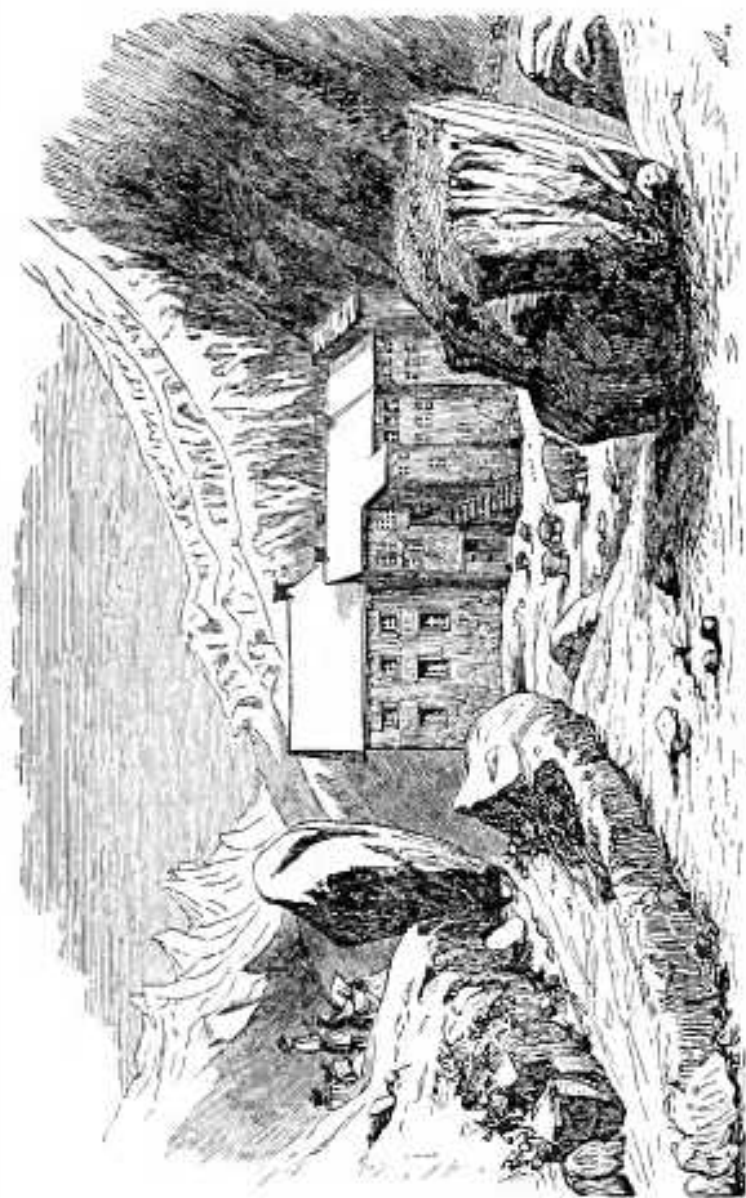
HOSPICE OF THE GRINSEL.