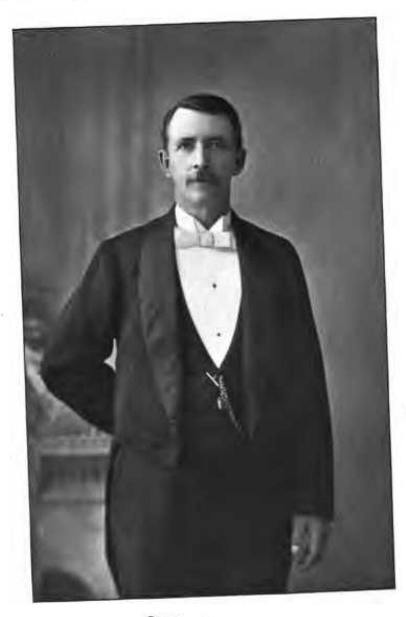
Very truly yours Chauncey & Peck.