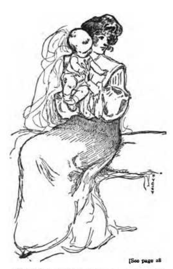
"'PERHAPS YOU WANT ME TO THROW MY BABY DOWN THE STAIRS?"