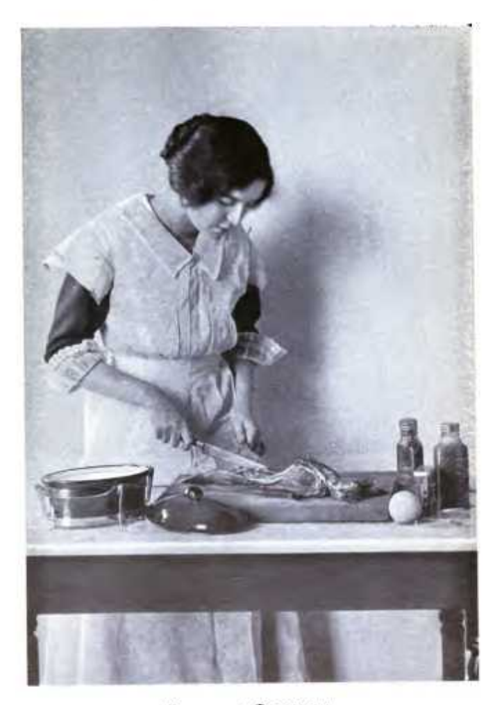
RABBIT EN CASSEROLE