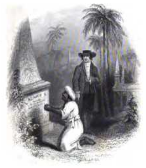
Broom at the book of House to