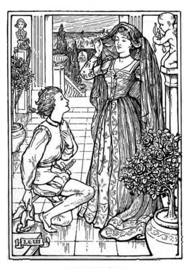
CESARIO AND OLIVIA