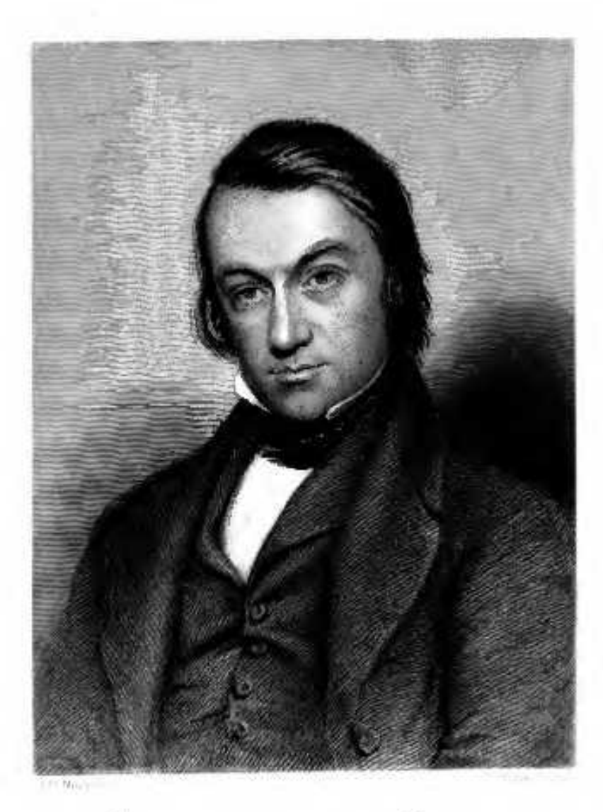
Ever gran ting