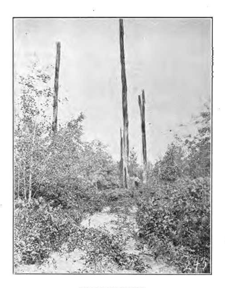
THE SHAME OF MICHIGAN. Typical old "Plue Stub."