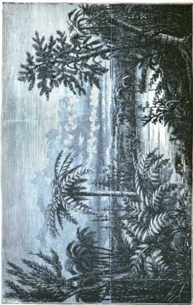
CARBONIFEROUS PTERIDOPHYTA.—(After Dana.)