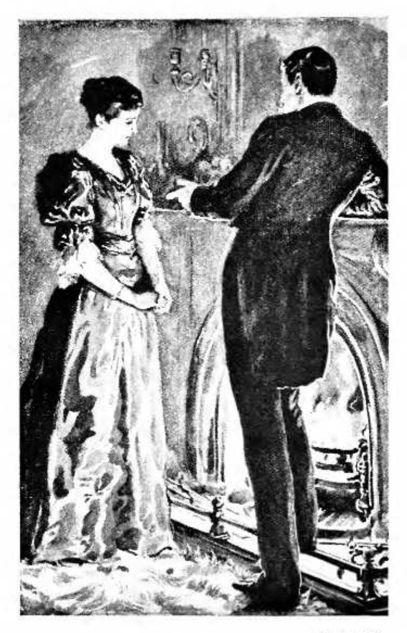
See page 58,