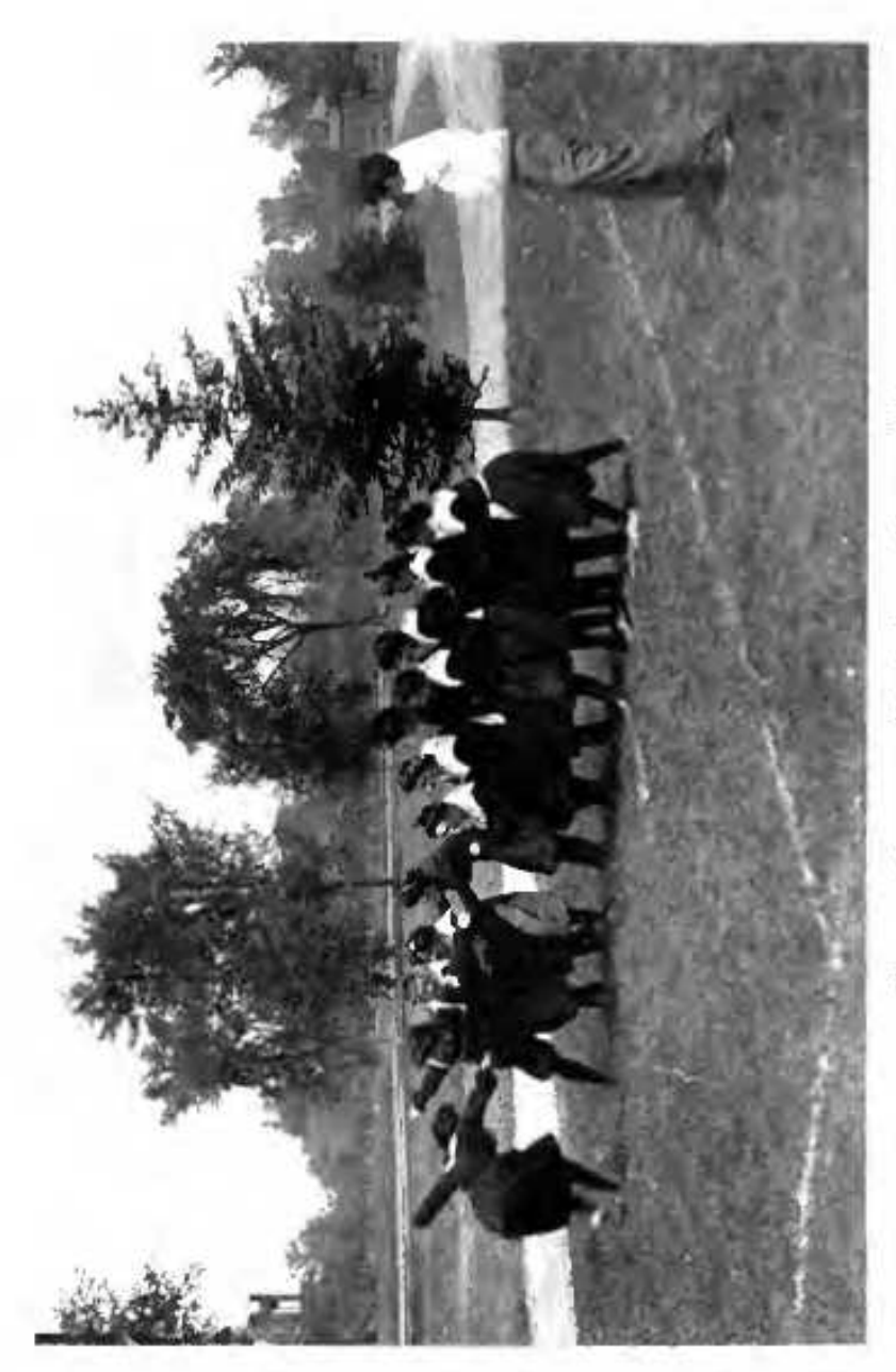
Fox axia Chickess, Frontispiere, Seepop 112