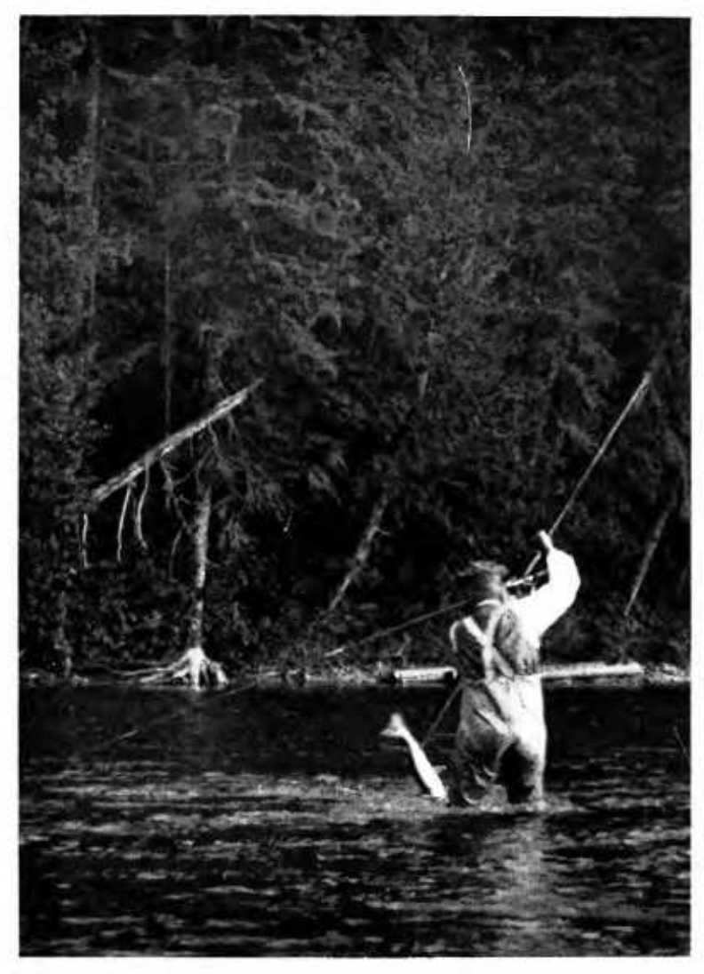
THE AUTHOR GAFFING HIS OWN SALMON PLAYED ON A 8-OUNCE ROD