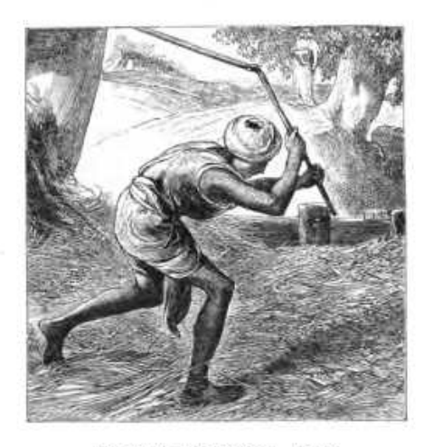
GIDEON THRESHING CORN,

THOMAS NELSON AND SONS, LONDON, EDINBURCH, AND NEW YORK.