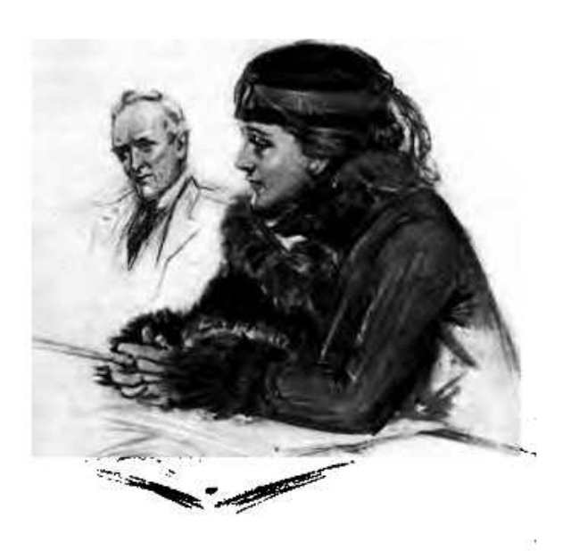
She was looking into his eyes, calmly, seriously, and, he thought, a bit speculatively (Page 13)