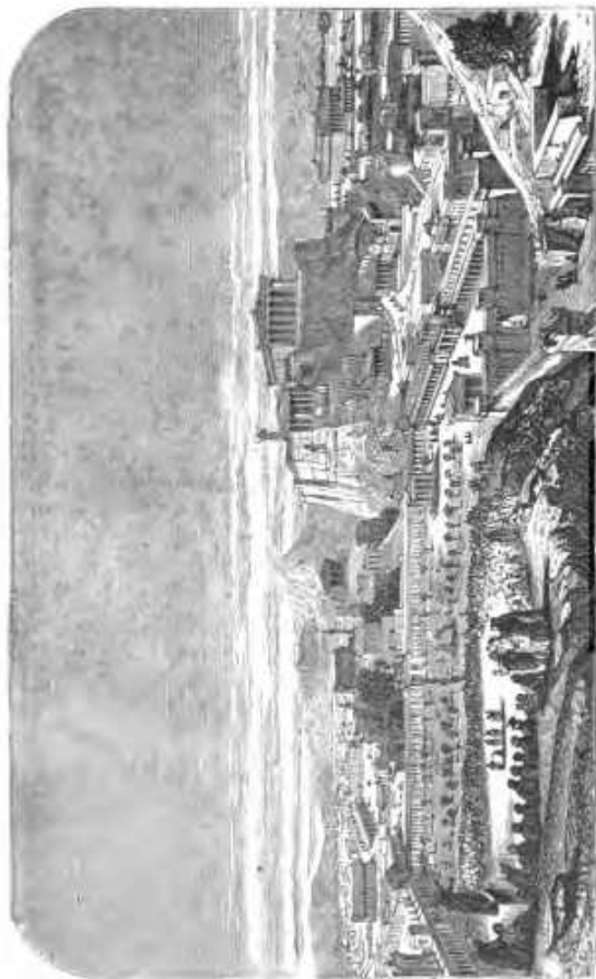
ATHENS RESTORED, FROM THE PNYX.