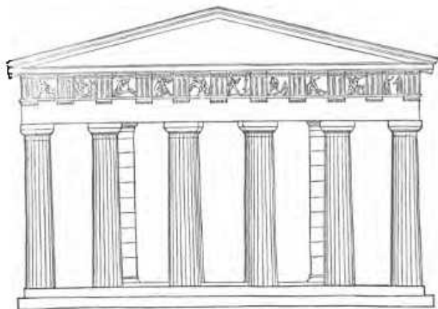
THE THESEUM RESTORED.