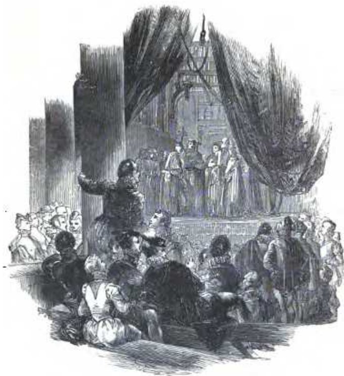
A PLAY AT THE BLACKFRIARS.