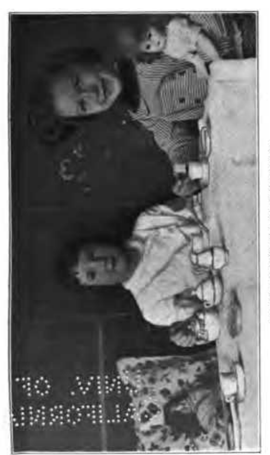
ON THE WAY TO HAPPY WOMANHOOD