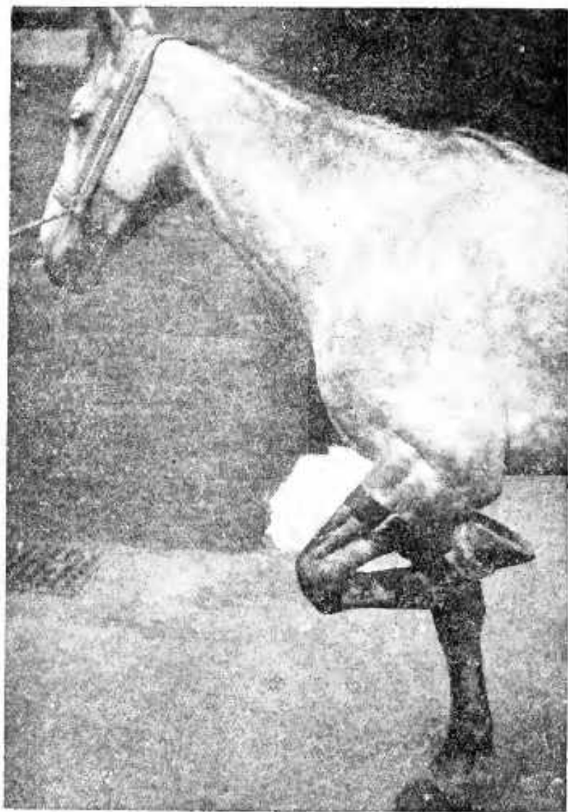
RAREY'S LEG STRAP APPLIED.