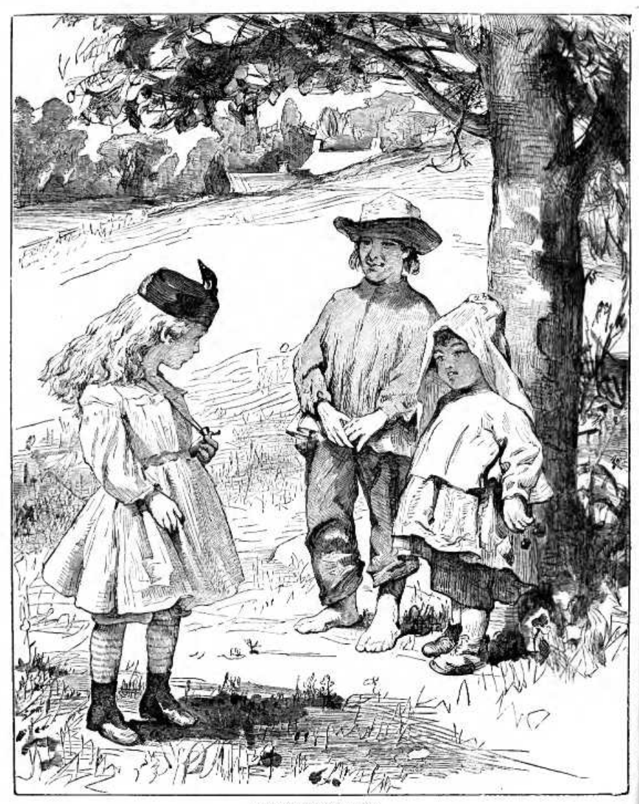
TOWN AND COUNTRY.