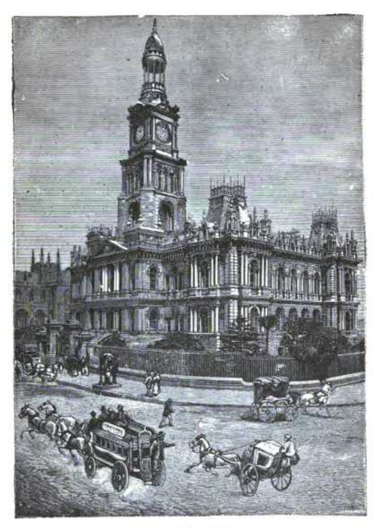
TOWN BALL SYDNEY.