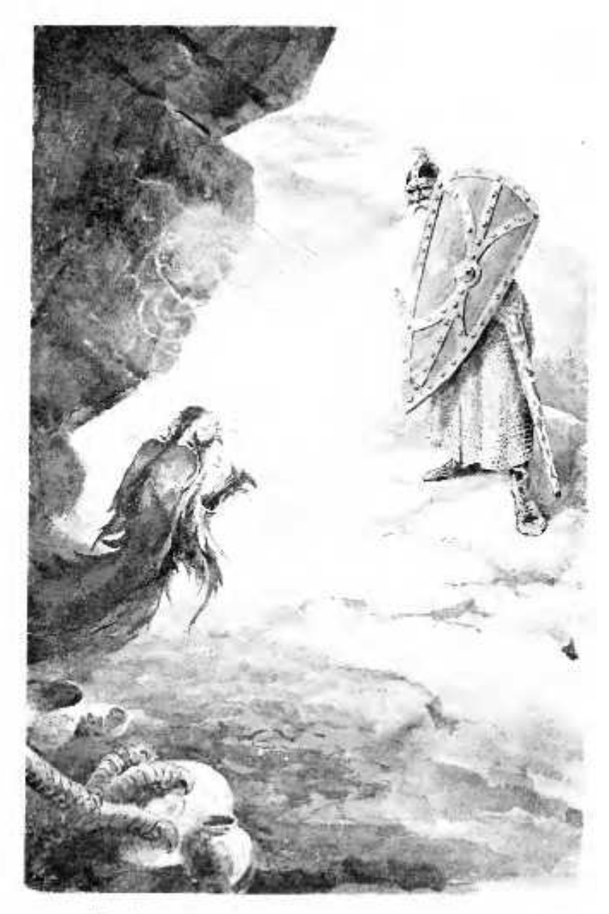
The hero brought up his shield with a quick motion