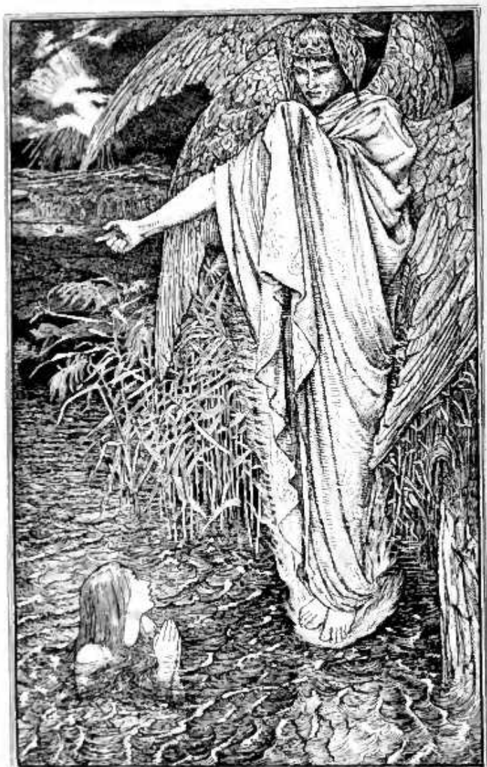
HOW SHEAN DECEIVED EVE IN THE RIVER