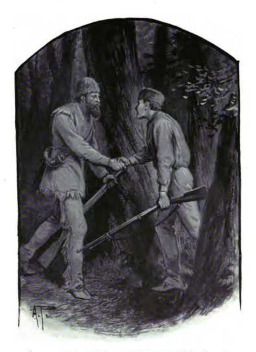
"THE NEXT MOMENT THEY CLASPED HANDS" (see p. 134).