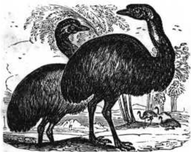
EMUS OF NEW-HOLLAND.