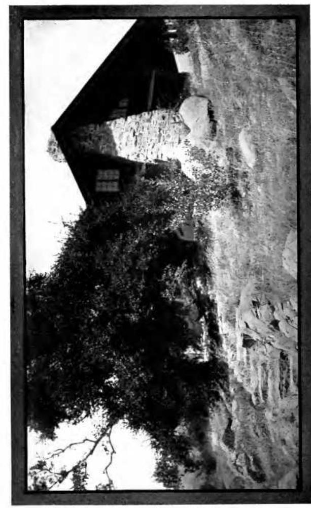
Plan on page 61; other return, pages 9, 40, 61. The C. W. Robertson home, Northoff, Cal., is not a bungalow according to our definition of the term, for there are bedrooms in the upper story. It is, however, one of the most successful adaptations from the Swiss châlet type in the United States, and is particularly harmonious in its setting