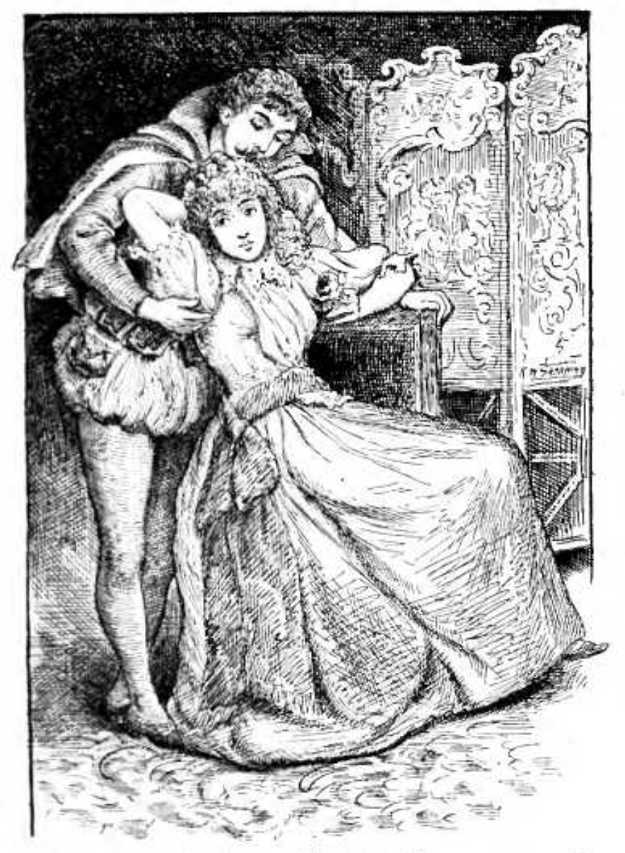
"I thought that all acting was making love in tights to pretty women." Vide p. 2.