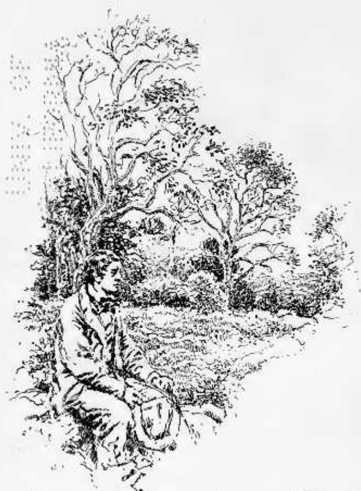
This was the boy's war out there on the fields amid the dark shadows of the ground and amid the white shadows of his spirit.