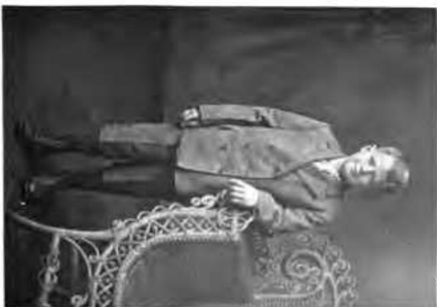
AFTER A BATH AND CHANGE OF CLOTHING

A deserted, homeless and penniless nine-year-old boy, who, in December, 1911, in a town of less than eight thousand, crept into a grocery store, by a side entrance, and got something to eat, was arrested and placed in the county jail