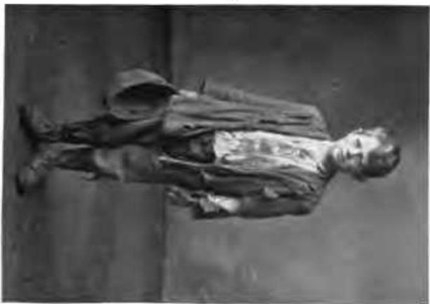
JUST OUT OF JAIL