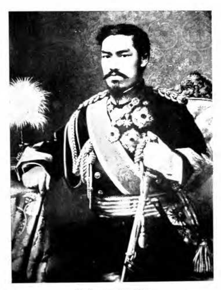
The Emperar Mutsu Hito