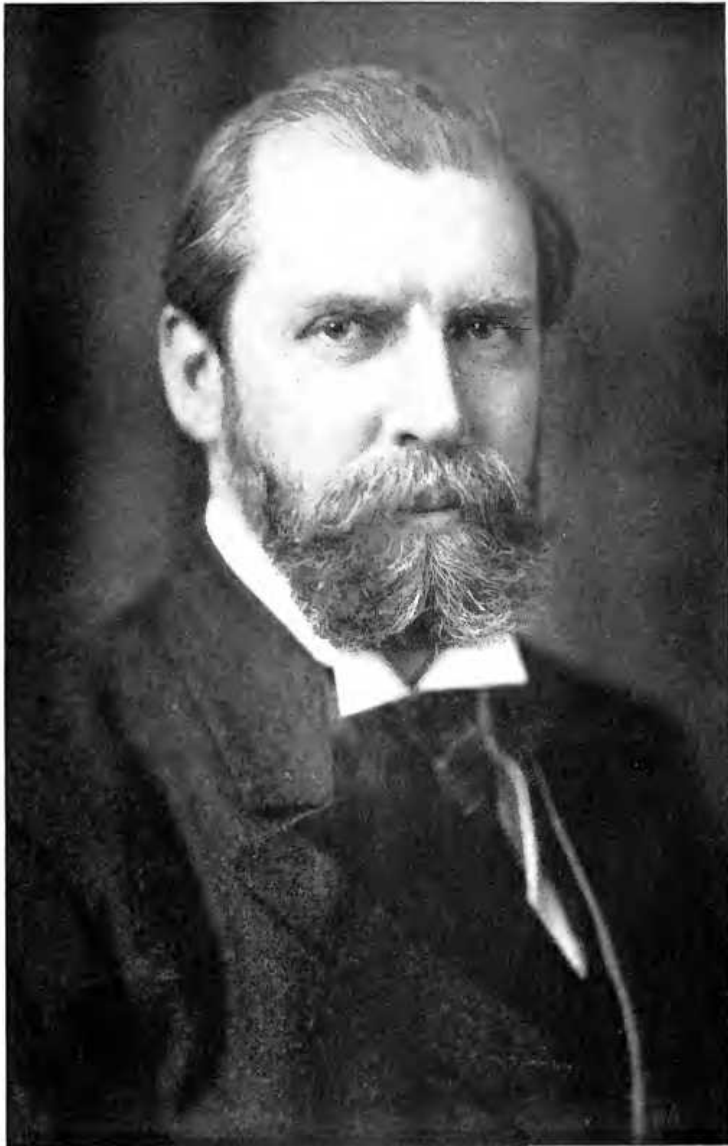
CHARLES EVANS HUGHES