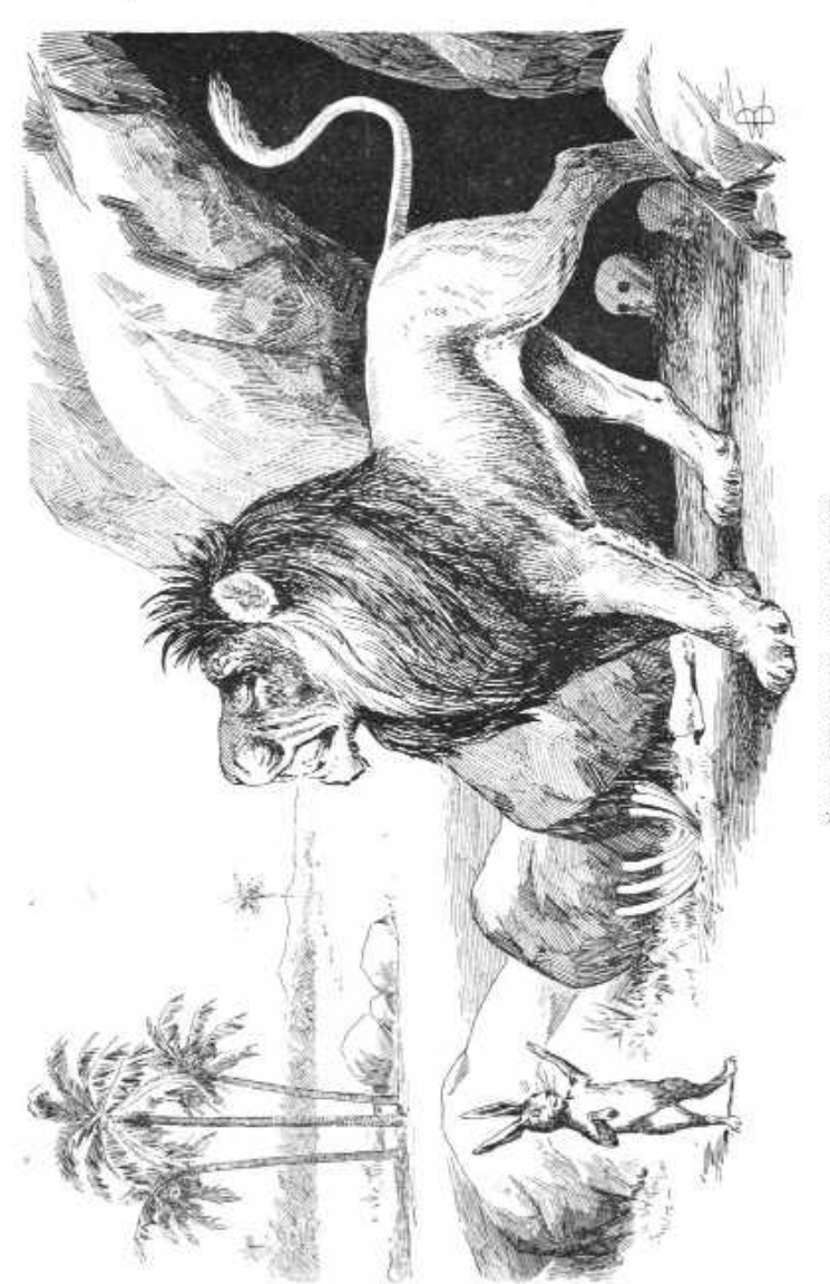
" HE DWELL IN A DARK CAVE.