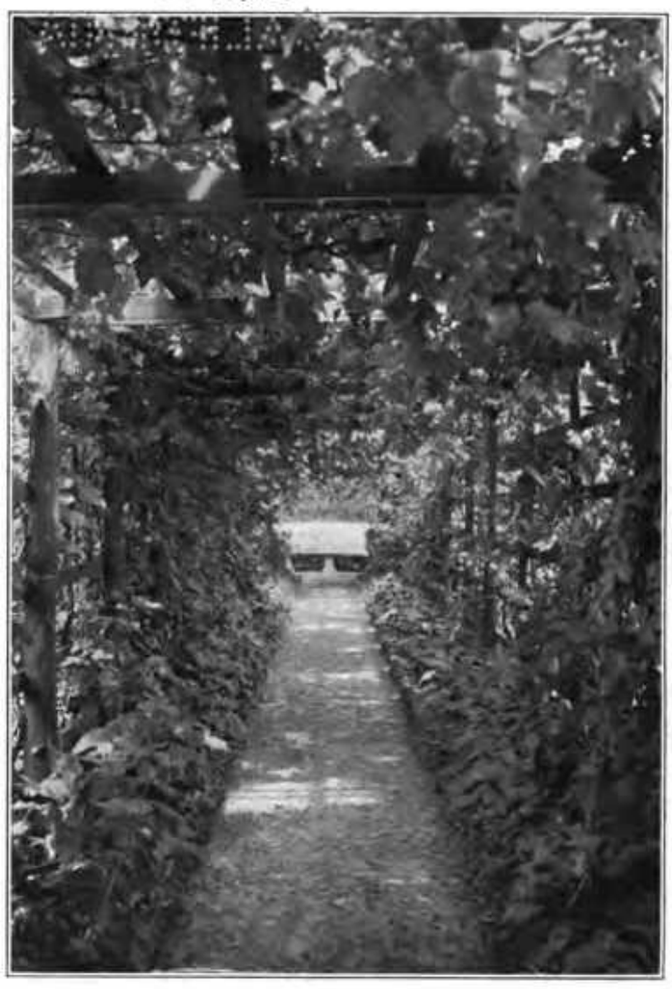
Honestly! Don't you wish this fruitful arbor was just outside your dining room door?