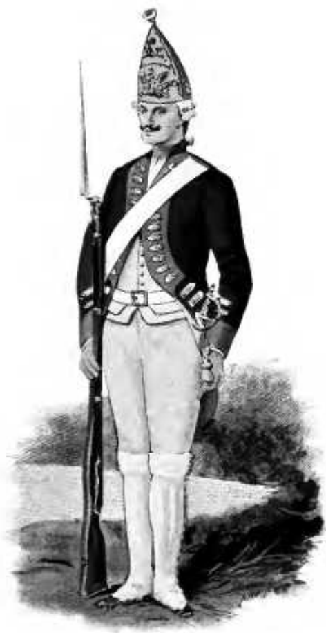
A GREAT GRENADIER.