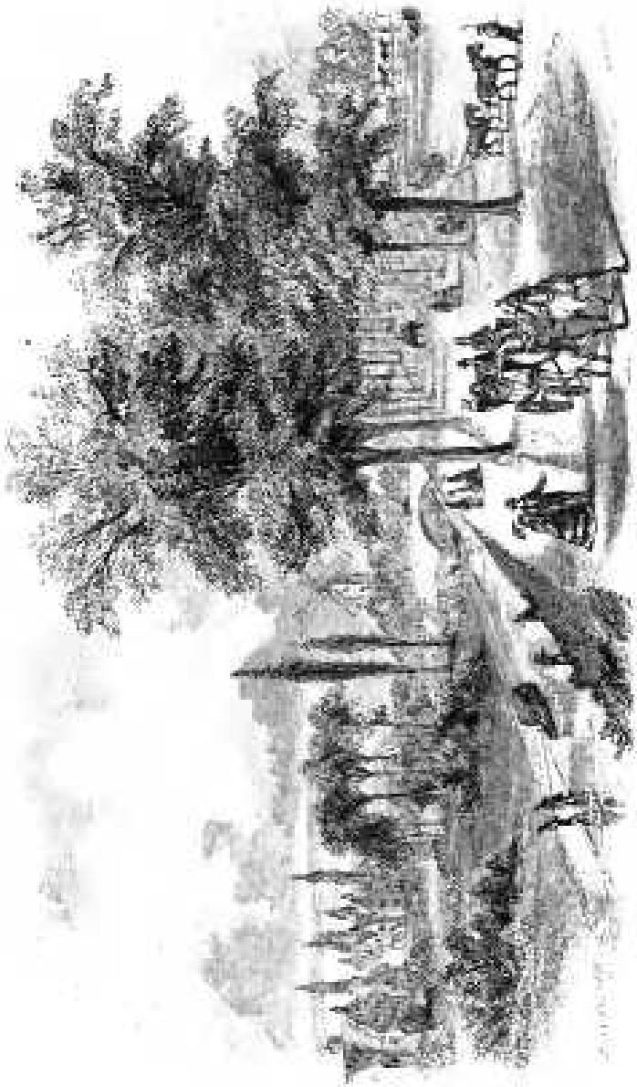
HOLLO IN HOLLAND.