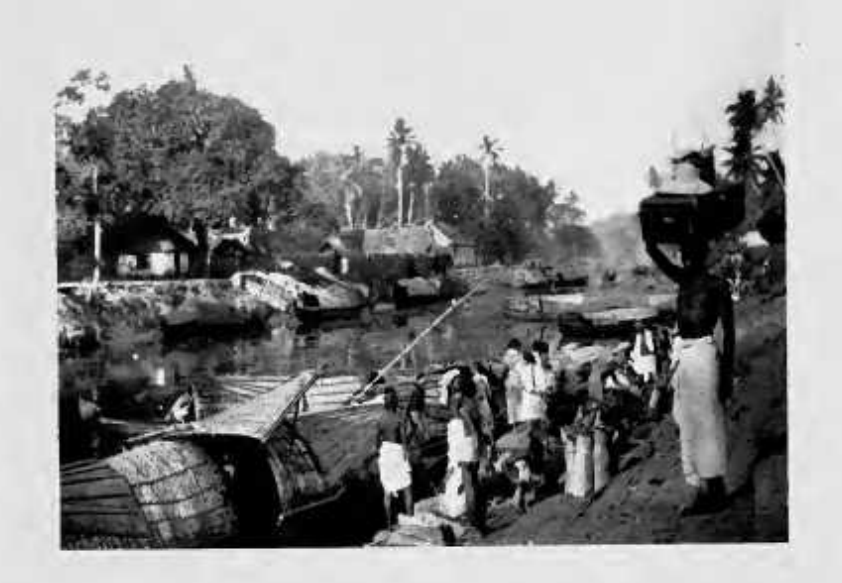
ALLEPPEY, IN MALABAR